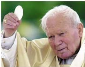
Pope Holding the Roman Catholic Jesus The Eucharistic Jesus offered as an unbloody sacrifice

Roman Catholicism declares that our salvation was not complete by Jesus' death on the cross. Salvation the Roman Catholic way requires the Sacrament of the Eucharist to be administered by Roman Catholic priests. If this is the case, Jesus died on the cross in vain. Salvation is not Roman Catholicism plus Jesus. Biblical salvation is based on faith in Jesus alone!