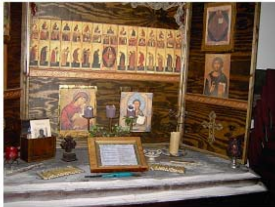
A Prayer Station that was on display at Capo Beach Calvary April, 2005 - with instructions on how to pray with an icon

The common denominator being promoted is the idea that the time has come for Christianity to be reinvented for our generation. In order to do so, the church must provide the environment and the experiences to attract people. Christianity, the Emerging Church promoters say, must become relevant to our postmodern generation. No longer does reason or God's Word hold the answers to life's questions. Experience must become the key factor to encounter spiritual reality.