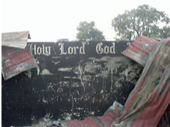
Remains of burned Baptist church

Rampaging Muslims have killed 10 Christians, injured 61 others, destroyed nine churches and displaced more than 500 people in northern Nigeria, according to eyewitnesses – all because Muslim high school students claimed a Christian student had drawn a cartoon of Islam's prophet, Muhammad, on the wall of the school's mosque.