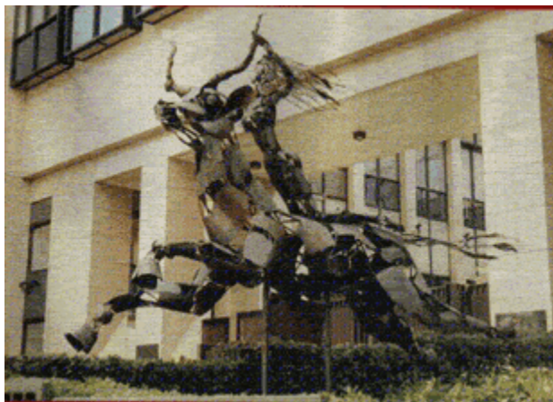
Sculpture 2000 - Outside the European Council Buildings in Brussels

sculpture of this evil, scarlet woman, riding the evil beast. Is she the woman referred to in Revelation 17?