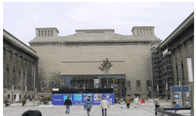
Germany’s Pergamon Museum in former East Berlin

On its steps early Christians were martyred for their unswerving faith in Christ. German archaeologist Carl Human found it in almost perfect condition in the late 1800’s and carefully shipped every stone to