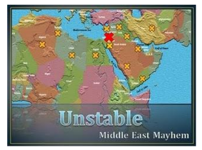
North African and Middle East regions.

http://prophecynewsstand.blogspot.com/2011/05/is-arab-spring-headed-for-mideast.html