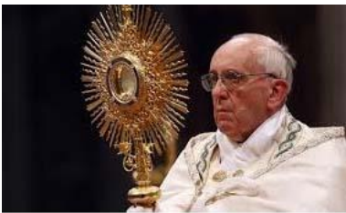
Pope Francis and the Eucharistic Jesus

While loving others is a quality all Christians should embrace and promote, using Pope Francis as the perfect example, seems somewhat opportunistic. The fact that he calls Pope Francis "our new pope" indicates that he has accepted the pope as the head of the Catholic Church and the church that he himself leads. If that is not the case, why would have he used the word "our".