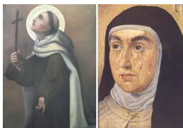
St. John of the Cross