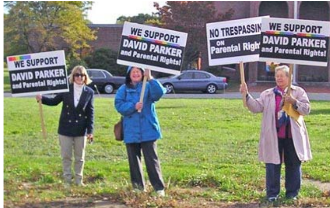
Yes! We're taking BACK the rainbow !!!

Concord District Courthouse was busy today! You can't see it from here, but the parking lot was completely full!