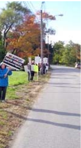
ed the roadway

Concord District Courthouse was busy today! You can't see it from here, but the parking lot was completely full!