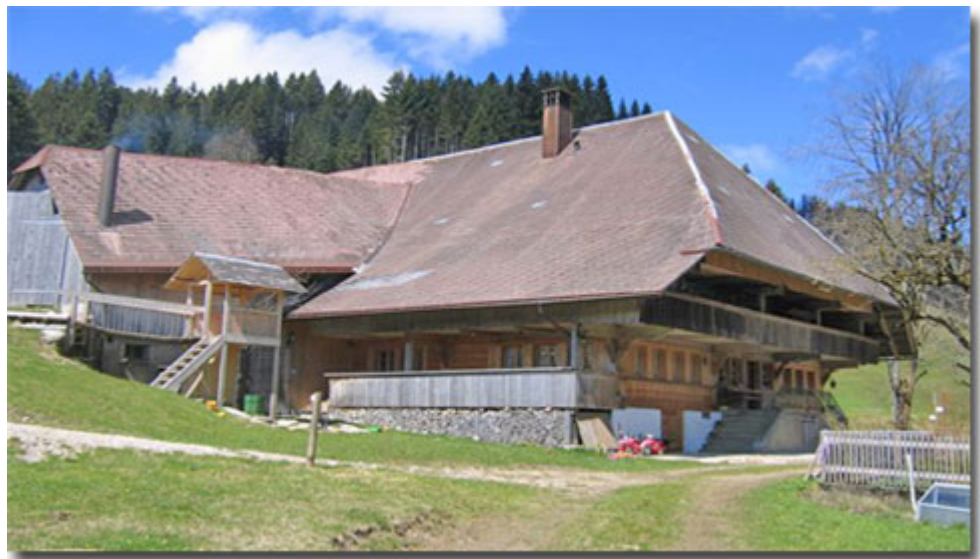
The Frankhauser family house near Bern, Switzerland

They are predecessors of the modern-day Amish, Mennonites, Puritans, Quakers, and Baptists. It was not unusual for them to dance, fall under the power of the Holy Spirit and speak in tongues.