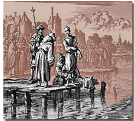
How the Church dealt with “resisters”

In Zurich, Switzerland, Ulrich Zwingli A.D. 1484-1531 spearheaded the radical reformation of the Anabaptists.