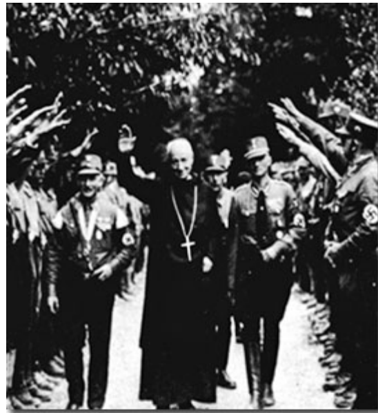
The Church and the Third Reich

THE RESISTORS! These are last days believers who uncompromisingly proclaim that Yeshua is the ONLY way to the Father, and there is NO OTHER name under heaven through which a man can be saved.