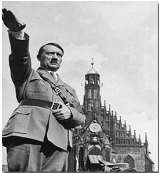
Church and State