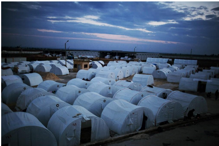
Image: Turkey has eagerly invited 2 million refugees into their country to stay at camps funded by upward to 6 billion USD, not out of altruism, but to use refugees together with the US, NATO, and the EU, as a geopolitical weapon.

In fact, Turkey has brought in over 2 million refugees with a suspiciously eager “open door” policy and has spent upward to 6 billion USD on building and maintaining these immense camps. They have done so as part of a long-standing strategy to justify creating “safe havens” in northern Syria – essentially NATO invading and occupying Syrian territory, protecting their terrorist proxies within Syria’s borders so that they can strike deeper toward Damascus and finally topple the government of President Bashar Al Assad .