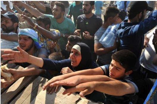
Image: The Western media ensures that articles discussing the possibility of using the refugee crisis as justification to further decimate Syria includes lots of pictures of desperate refugees struggling to burst into Europe.

The Huffington Post's article, " David Cameron Facing Pressure To Bomb Islamic State In Syria After Lord Carey Calls To Group To Be 'Crushed' ," in covering the political discourse in England provides us with the final reveal of what was really behind this sudden "crisis."