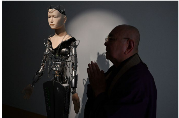
Mindar is a robot in Kyoto, Japan, and recites the Heart Sutra to worshippers.